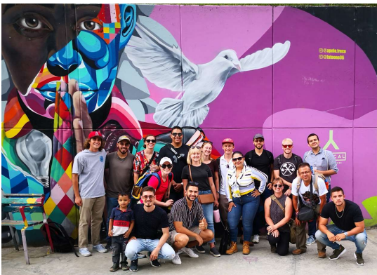
PIRE team members in front of a mural in La Comuna 13

Although the project is focused on small-scale mining, it is important to not forget about the large scale mining companies as both small and large scale are intertwined with each other. Students on this trip were able to meet with speakers from Mineros SA (a large scale mining company) at their headquarters in Medellin and talk to their company representatives on their perspective of ASGM. The conversation focused on who Mineros SA is, what they do, where they operate, their corporate social responsibility, and what they are doing proactively to work with small scale miners in the areas that they work in.