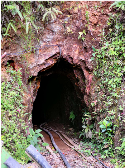
Small-scale mine entrance in Antioquia, Colombia

Small-scale miners in Colombia are often referred to as “artisanal” or “traditional” miners because of the traditional, minimal technology methods they use to mine their ore. Much of the mining that is done in the region surrounding Andes is of the hard rock or underground form of mining. This is where miners are following the twisting vein of gold-containing rock deep into the mountains, sometimes even 400-500 feet below the surface. In large-scale mines of similar type in countries such as the US or Canada, the mine shaft traveling underground would be hundreds of feet wide, fully illuminated and ventilated. This is far from the case in Colombia, where mine shafts are barely bigger than a man, with little to no supports, illumination and ventilation in the mines. The miners also use traditional drilling and blasting methods for extracting the ore and transportation of the ore to the surface is all up to the strong backs and nimble feet of the