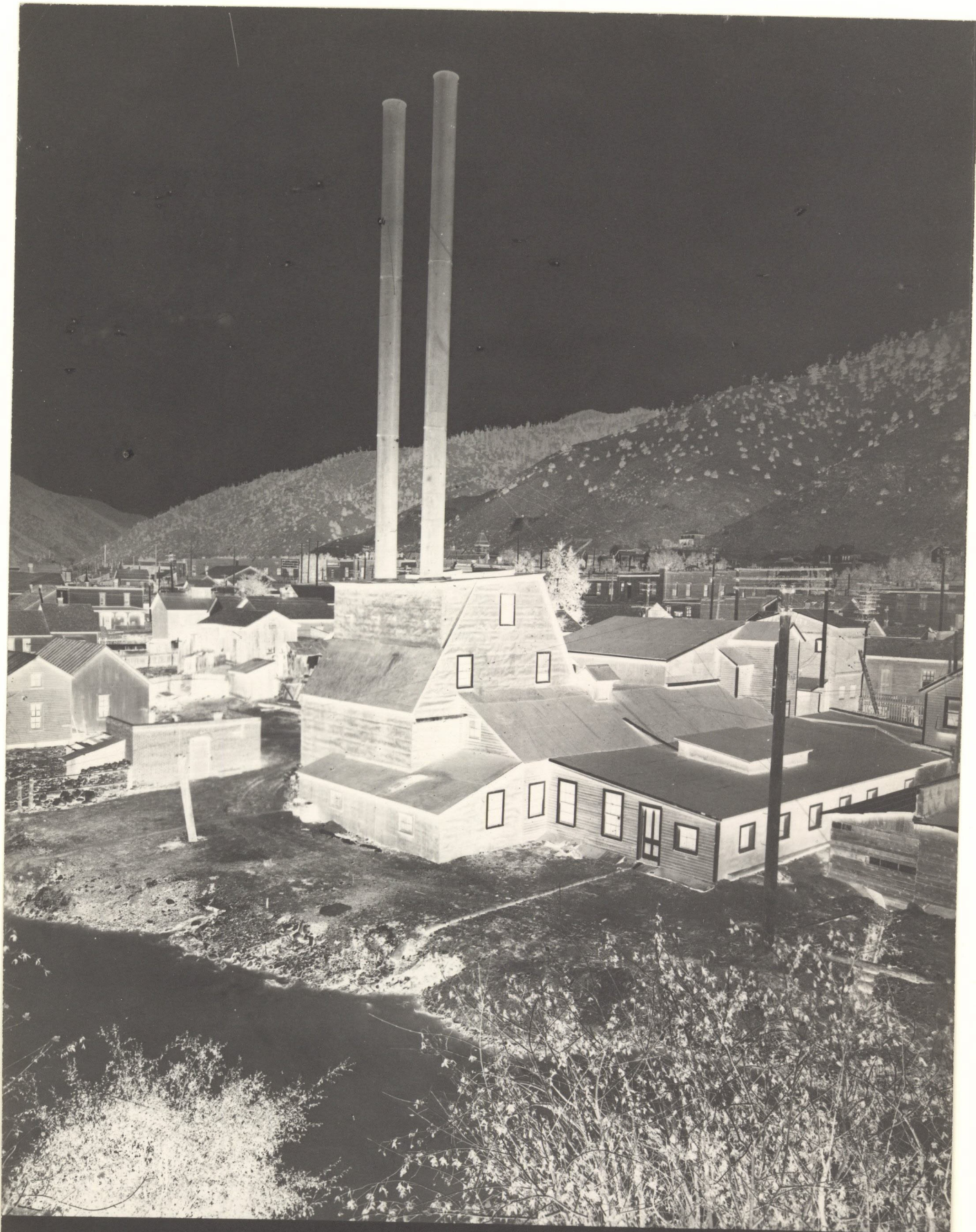
Gem Power Plant Steam Station A.