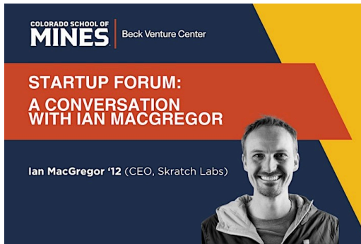
Free startup events this fall at the Beck Venture Center