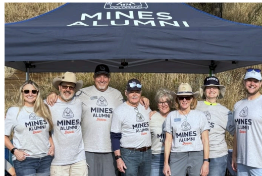
Rep your city in Oredigger style with new alumni T-shirts