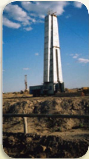
Russian Uranium Drill Rig