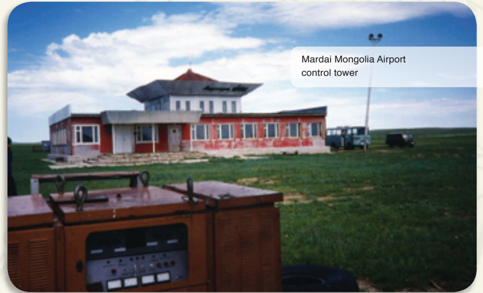
Mardai Mongolia Airport control tower