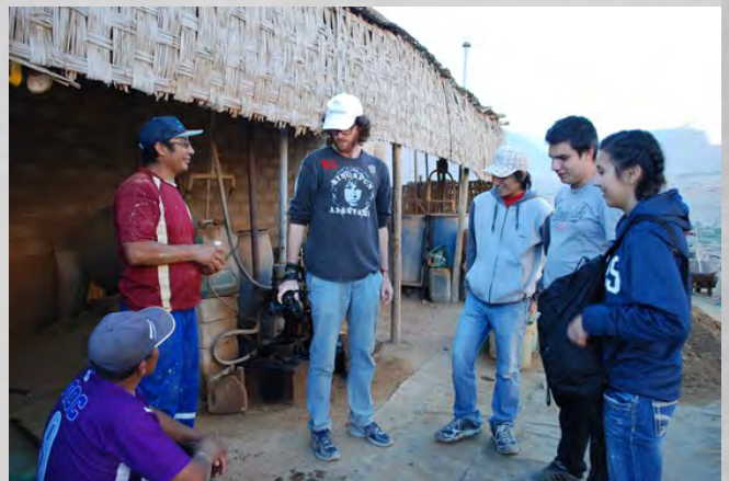
Photo caption: Students from Mines and UTEC and NGO representatives from the Alliance for Responsible Mining (ARM) in Colombia learn about ASM ore processing systems in Peru.

This fall semester, I taught a new graduate course titled Energy, Natural Resources, and Society, and I am currently developing two new courses for Spring semester: an undergraduate course titled, Communities and Natural Resource Development, and a graduate course titled, Sustainable Development and Mineral and Energy Resources. This course will apply an innovative teaching methodology via video-conferencing that links together faculty members and graduate students from Virginia Tech and the National University in Medellin, Colombia. I am very excited for this opportunity to bring together scholars and students across geographic, cultural, and disciplinary boundaries to discuss sustainability and earth resource development. I look forward to contributing to the holistic training of our industry leaders of tomorrow and welcome any ideas for collaboration with our esteemed alumni, industry partners, and mining engineering advocates.