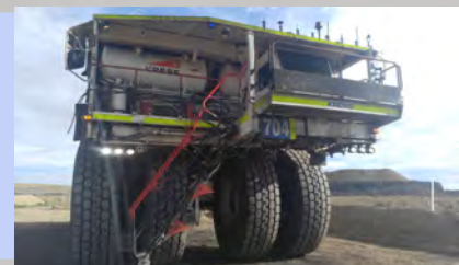
Photo taken at the Navajo Mine, North American Coal in Colorado.

Our undergraduate and graduate students participate in internships all over the US and the world including USGS at the National Earthquake Information Center, North Antelope Rochelle Mine, Lehigh Hanson, Navajo Mine, Aggregates Performance Team, SRK Consulting and Newmont Mining Corp. If you have internship opportunities for our students, let us know!!!!!!!