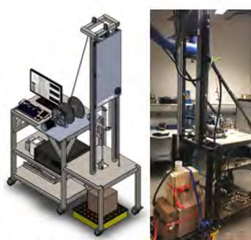
Figure 1. Drawing and Picture of CSM Drillbot